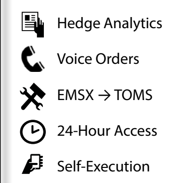
FIG EXECUTION CAPACITY

UP TO 80% BALANCE SHEET SAVINGS OVER CASH TREASURY