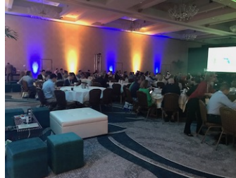
During the "Bond Talks" session at the 2018 SFBTA Annual Conference

Please contact us at info@SouthFloridaBondTraders.org to request a Charity Submission Form. We look forward to hearing your ideas!